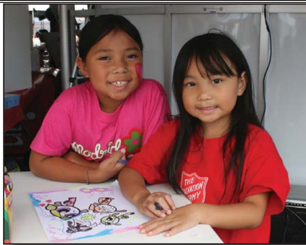
Enjoying the keiki activities during the dedication ceremony.