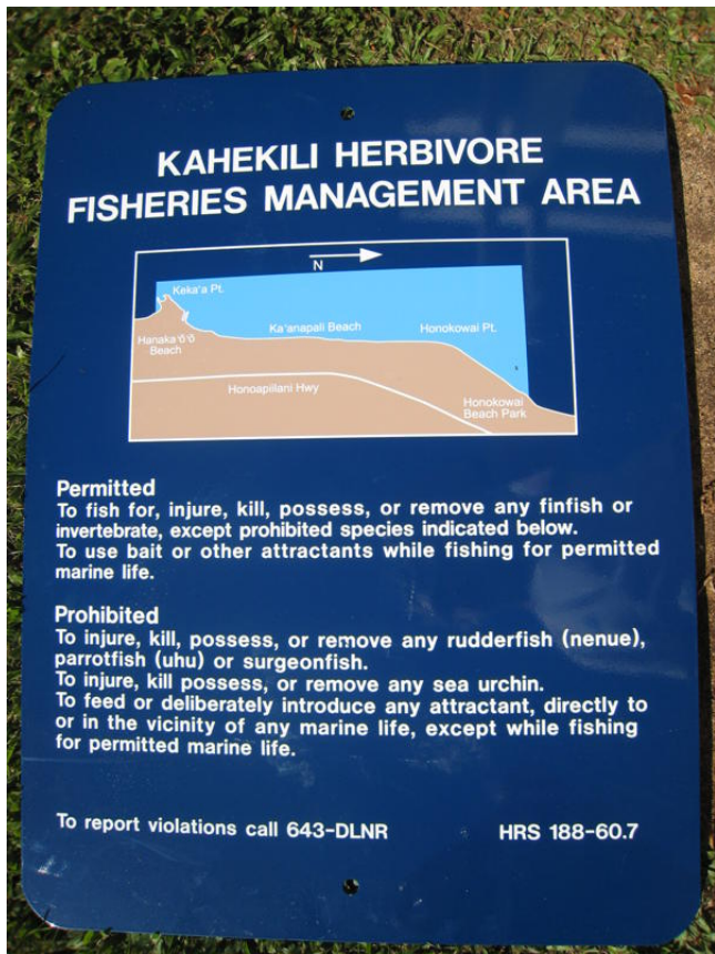
Close up of sign.