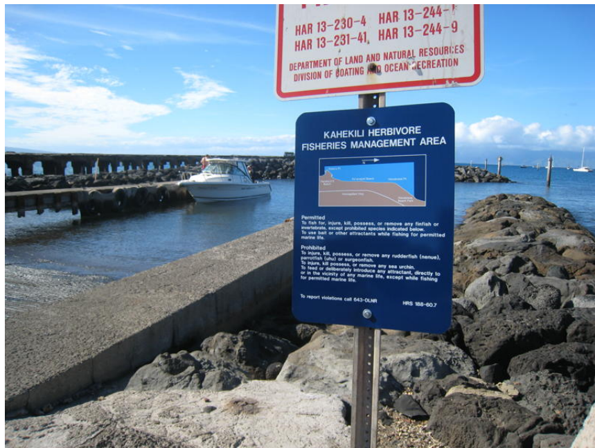
Sign at Mala Wharf