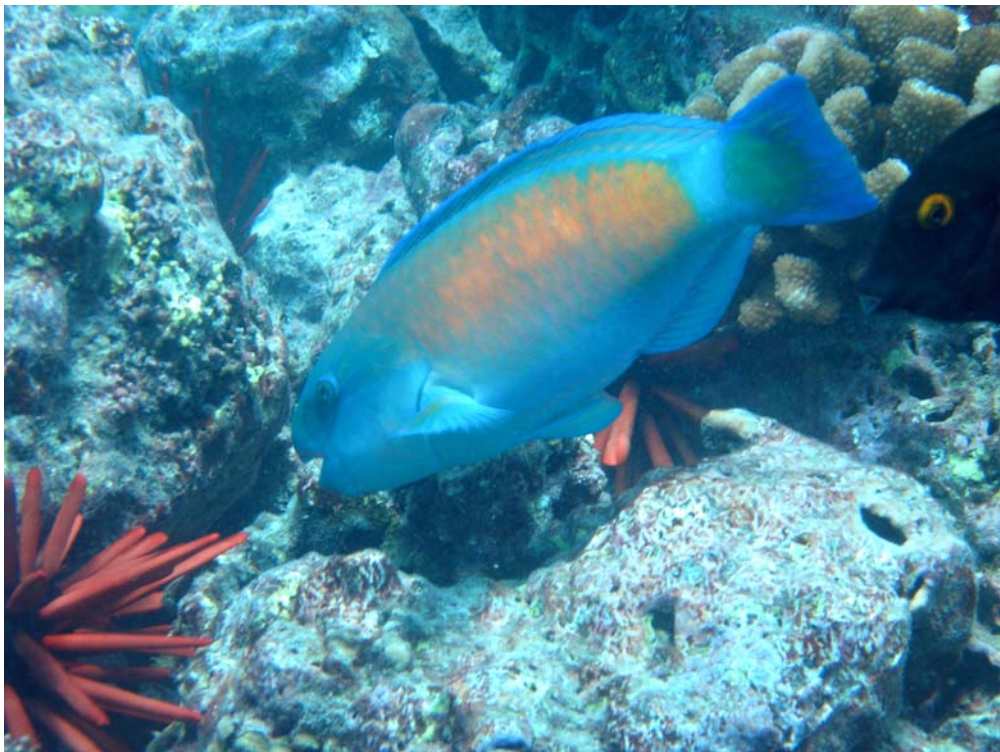
Parrotfish helps keep the coral clear.