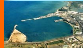
Kahului Harbor Maui