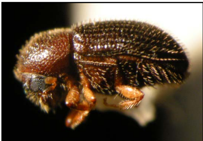
Figure 1. Enlarged photo of an adult Hypothenemus hampei .