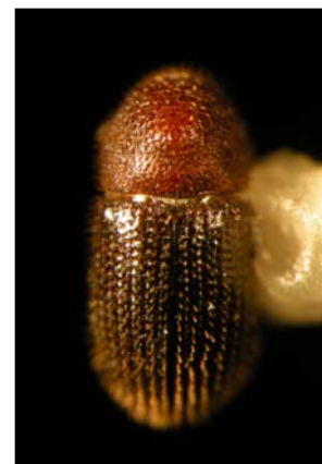
Figure 2. Enlarged top view of CBB.

Female beetles bore holes into mature and immature coffee berries, still attached to the tree, through the scar on the blossom end of the berry. They create "galleries" in the berries, where they deposit their eggs. Once eggs hatch, beetles larvae eat their way through the berry and into the bean, or endosperm, of the seed. 2, cited by 3 Reproduction can continue in berries that fall to the ground. 3 Adult females remain in the berries once eggs are laid. The progeny will emerge to find new berries to deposit their eggs. 4, 5