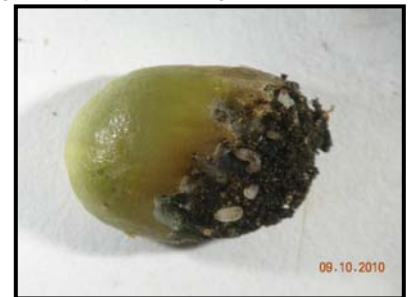
Figure 8. CBB larvae devouring coffee bean.