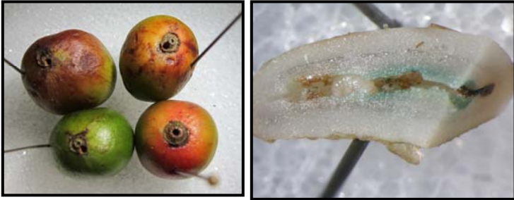
Figures 5 & 6. Entrance holes at blossom end of berry (Left). Larva in gallery, also showing secondary fungus (Right).

Damage. One noticeable characteristic for preliminary field identification of CBB is its point of entry into the coffee berry. While the Tropical Nut Borer and Black Twig Borer may enter the berry from the sides, CBB bores through the scar at the blossom end of the fruit. In addition, the Black Twig Borer will readily infest coffee branches, while CBB will only attack the berries.