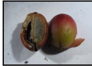
Figure 7. Opened coffee berry with damage inside.