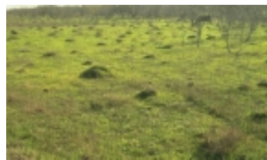
RIFA mounds in pasture