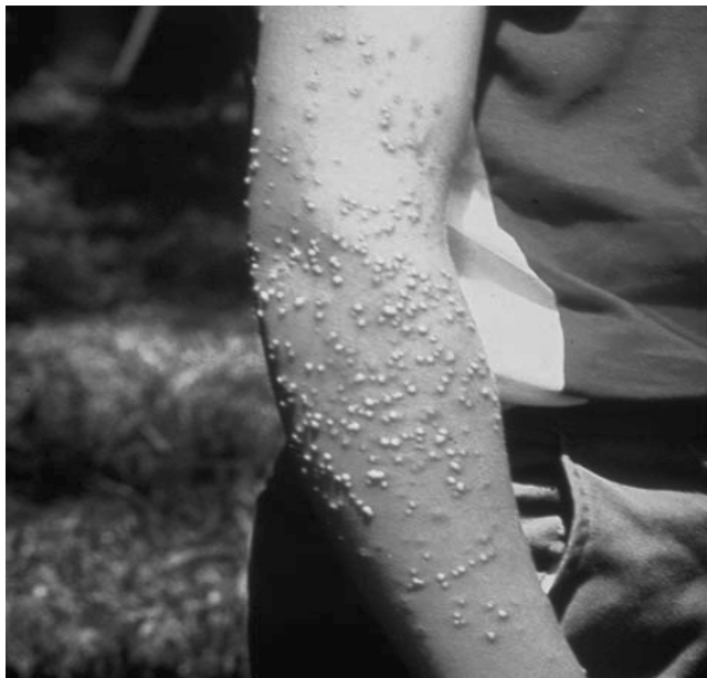
Typical sting symptoms.

their mound. They can sting repeatedly. Typically, the ant grasps the skin with its jaws and inserts its stinger into the flesh, injecting venom from the poison sac. Pivoting its head, it can inflict an average of seven to eight stings in a circular pattern. Symptoms of each sting are a burning and itching that lasts about one hour. A small