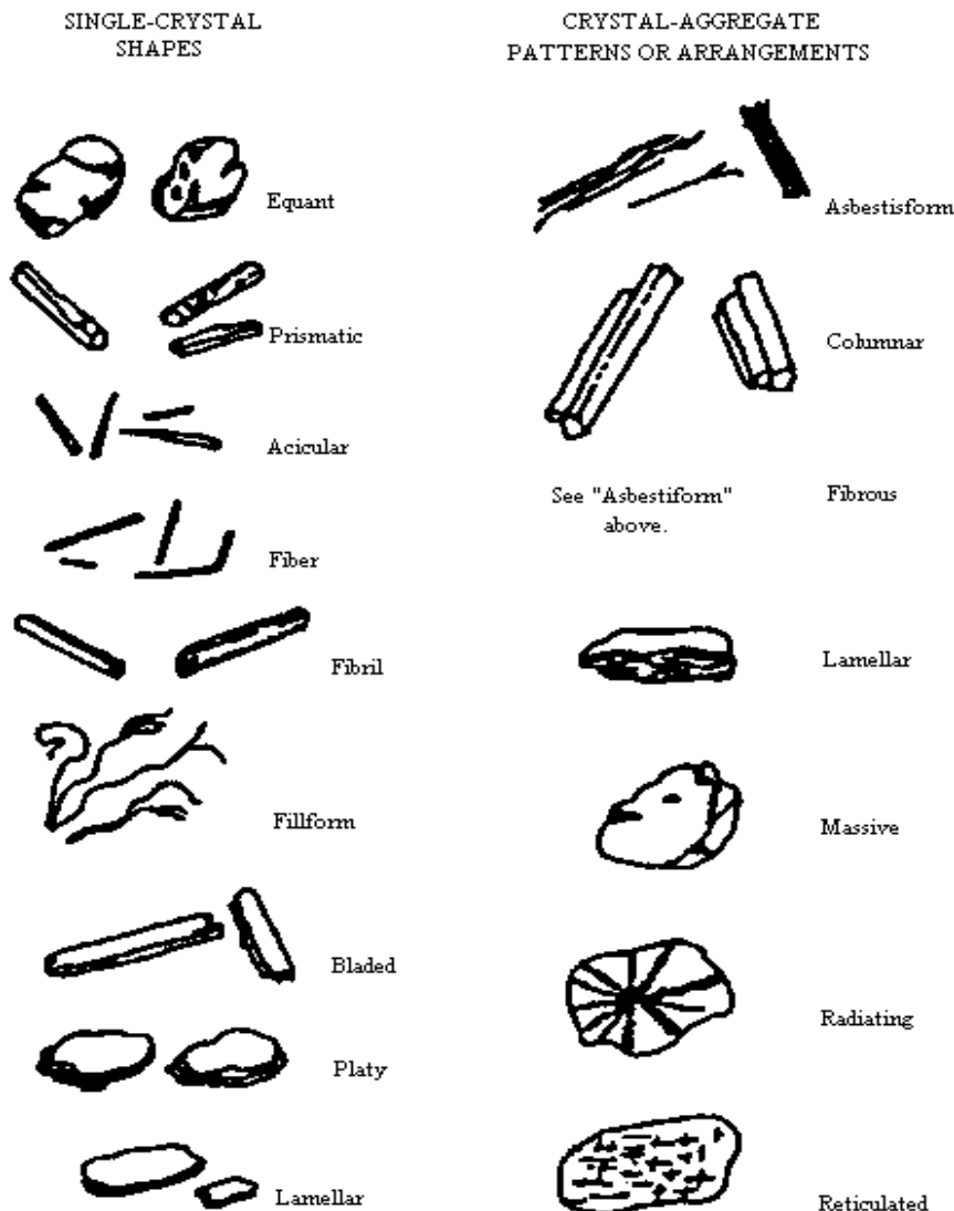
Figure 1. Particle definitions showing mineral growth habits.

For the purpose of regulation, the mineral must be one of the six minerals covered and must be in the asbestos growth habit. Large specimen samples of asbestos generally have the gross appearance of wood. Fibers are easily parted from it. Asbestos fibers are very long compared with their widths. The fibers have a very high tensile strength as demonstrated by bending without breaking. Asbestos fibers exist in bundles that are easily parted, show longitudinal fine structure and may be tufted at the ends showing "bundle of sticks" morphology. In the microscope some of these properties may not be observable. Amphiboles do not always show striations along their length even when they are asbestos. Neither will they always show tufting. They generally do not show a curved nature except for very long fibers. Asbestos and asbestiform minerals are usually characterized in groups by extremely high aspect ratios (greater than 100:1). While aspect ratio analysis is useful for characterizing populations of fibers, it cannot be used to identify individual fibers