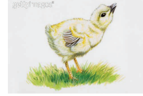
Henny Penny, The Sky is Falling!